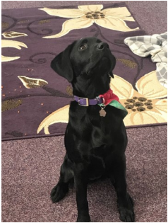
Nala waiting patiently for a treat