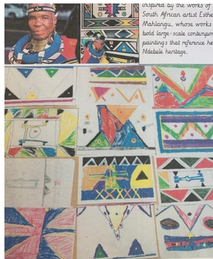
inspired by the works of South African artist Esther Mahlangu, whose works are bold large-scale contemporary paintings that reference her Ndebele heritage.

inspirational black people from the past who have shaped our future, from Rosa Parks in year 3 to Mae Jemison in year 6! Each class also created some fantastic artwork based around a different black artist.