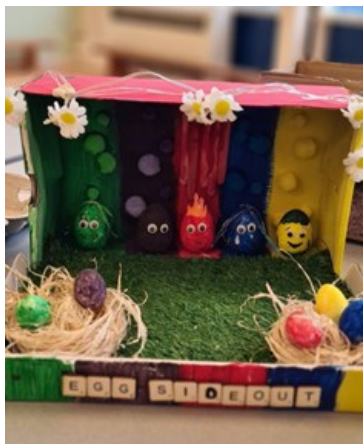
Egg Sideout by: Demi T 6S