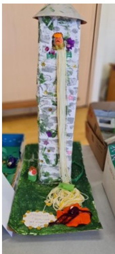
Eggpunzel by: Lilly B 4B