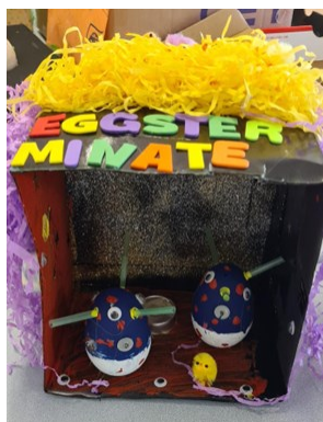
Eggsterminate by: Ellis W 3B