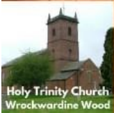
Holy Trinity Church Wrockwardine Wood